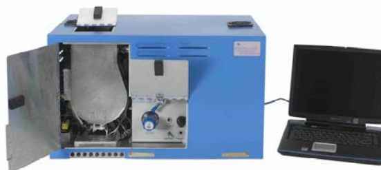
CT-1128 Portable GC-MS with Laptop

"(The) CT-1128 portable GC-MS has provided a lot of data in tracing (the) pollution plume in (the) Songhua River. The instrument is easy to operate and transport. It is capable of generating analytical results for quantitative and qualitative analyses for unknown samples within 20 minutes after arrival in the field. In the Songhua River pollution emergency response, the instrument was continuously operated for 345 hours in analyzing water samples. The working conditions of the instrument were very stable and provided sensitive and accurate analytical data. When operated at (the) selective ion monitoring mode with split injection, the detection limit for nitrobenzene (is) 1 ppb, which exceeded the monitoring requirement."